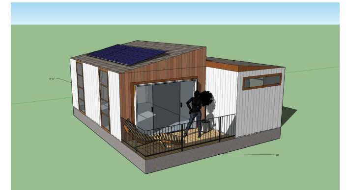
2 - 8x20' shipping containers with redwood accents and large back deck